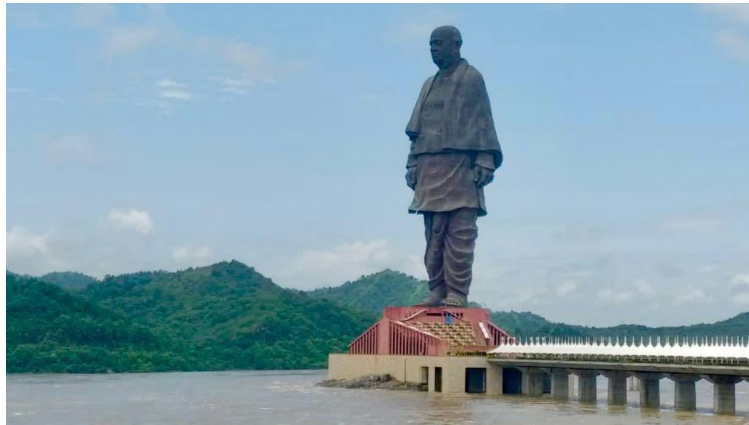
Statue of Unity standing tall on Narmada valley.

Born on the 31st day of October in the year 1875 in Nadiad, Gujarat, Patel was a polished lawyer by profession. Peeking into his political life, Patel was neither active nor a follower of Gandhian principles in the initial stages of the freedom struggle. He met Mahatma Gandhi in Godhra in 1917, which brought a massive change in his life. Patel quit his hard-earned job to be a full-fledged congressman obeying Gandhi's order.