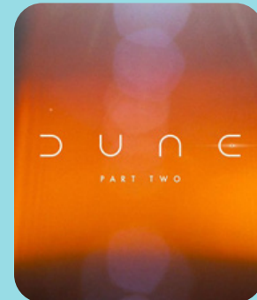
Dune: Part Two

After the success of Dune franchise, with reviews praising the movie's ambition and ability to deliver a visually thrilling adaptation out of convoluted source material. Director Villeneuve himself announced the release of DUNE: PART TWO on October 20, 2023.