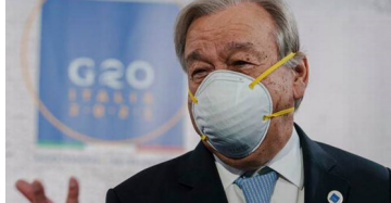
U.N chief says G20 didn't meet his climate hopes.

During the two-day meeting in Rome, the G20 leaders agreed to end financing for new overseas coal plants but did not set a specific year goal for achieving zero greenhouse gas emissions.