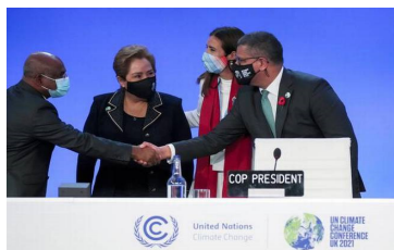
Key moments from COP26 climate summit.

only country that is committing itself to tackling climate change under the Paris Agreement. He told the world leaders that India will target a 'net-zero emissions' goal by 2070 and aim at increasing its non-fossil fuel energy to 500GW in its energy mix by 2030. Keeping India at the 'High-level Segment for Heads of States and Government' at the UN COP26 at Glasgow, he also mentioned that India has been working hard on tackling climate change-related issues. He also shared that India has around 17% of the world's total population out of which there is only 5% of the total emission. Following this he announced that India plans to reduce 1 billion tonnes of carbon emission from the total projected emissions and also reduce carbon intensity by 45% in its economy.