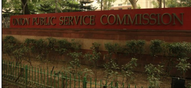
Union Public Service Commission, Delhi.

Union Public Service Commission (UPSC) has announced that it will be conducting an entrance exam for the National Defence Academy (NDA) on November 14, 2021. Following the landmark judgment of the Supreme Court, women candidates are also allowed to apply from this year onwards - the ruling was a great leap towards gender equality. This year, 1.7 lakh of 5 lakh candidates are women. It is