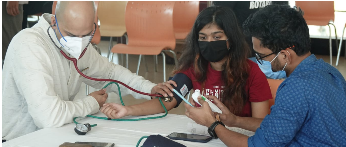
A volunteer at the campaign.

The Rotaract Club of Manipal and Kasturba Medical College (a constituent hospital of M.A.H.E.) organized a blood donation campaign on October 31, 2021. It took place in the Food Court 1, ground floor. More than one hundred and sixty people donated blood and the process went on for over six and a half hours. The campaign had seven steps in total, starting from registration to the confirmation of the blood group. Before the donation, the donors underwent a counselling session. The director of