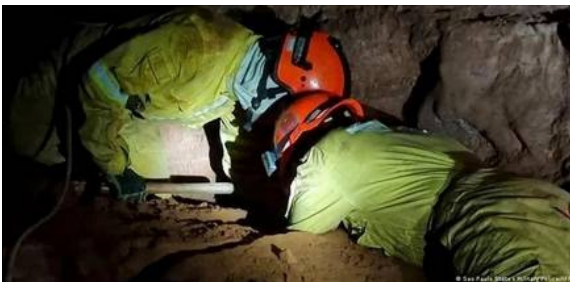
9 Brazilian Firefighters dead after cave collapse.

Earlier, officials stated that three people had died and six were missing. The identities of the victims were not disclosed. The Mayor's office stated that five people were transferred to a local hospital and discharged. The firefighters were joined by the police and ambulance in a desperate attempt to free those who were still trapped but the work was hampered by heavy rain.