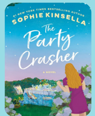
The Party Crasher

Book-The Party Crasher-From the #1 New York Times bestselling author of Love Your Life comes an amusing and endearing novel with regards to family, set against the scenery of the most remarkable party you've at any point slipped into.