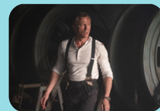
No Time to die

Daniel Craig's last James Bond film, No Time To Die's film industry assortment is great, especially during these Covid-19 influenced times, No Time to Die had a financial plan of $ 250 million however has procured an income crossing $ 600 million.