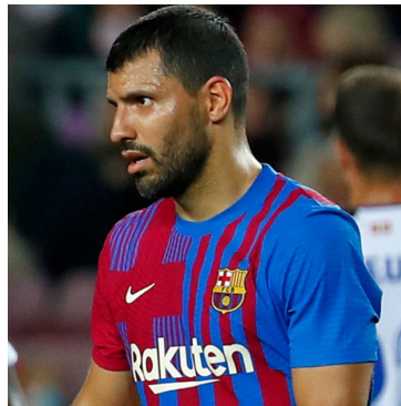
Sergio Aguero during the match between F.C. Barcelona and Deportivo Alaves.

He will be missing the impending champions league and La Liga game against dynamo Kyiv and Celta Vigo.