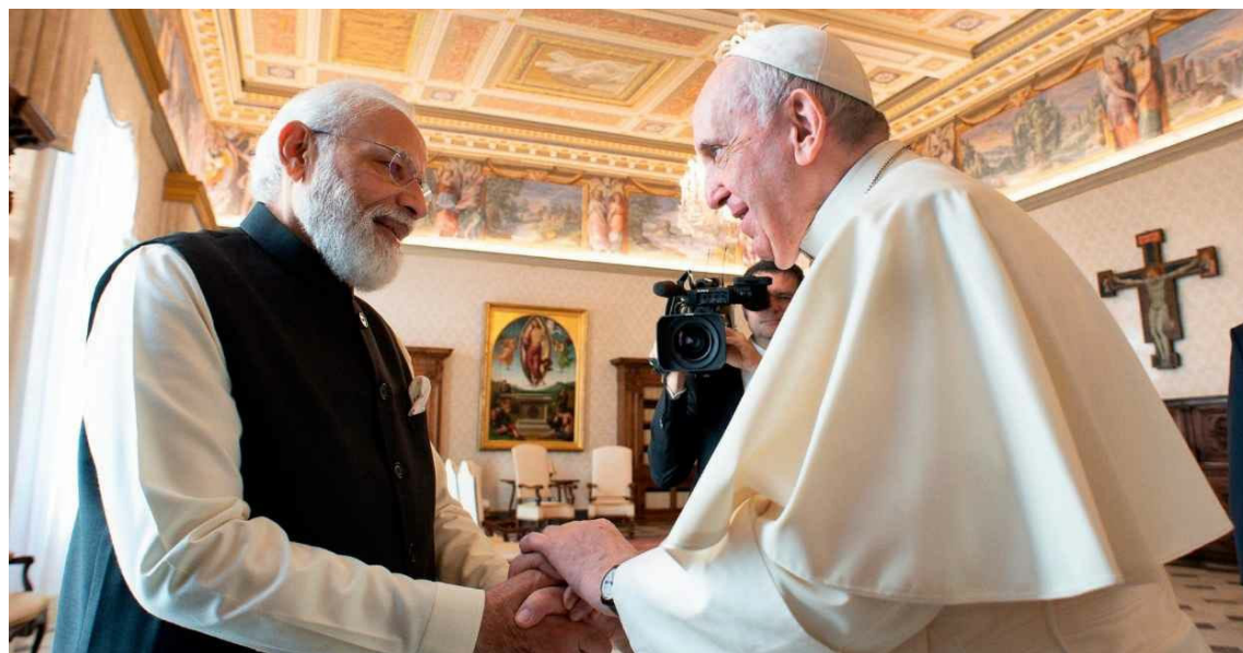
Pope Francis greeting Prime Minister Narendra Modi.

Before Prime Minister Narendra Modi, Jawaharlal Nehru, Atal Bihari Vajpayee, Indira Gandhi and I K Gujral had met the Pope John Paul II in Rome. The meeting was scheduled for just 20 minutes but it went on to 1 hour as they had to discuss issues like ending poverty and climatic problems. After the meeting with the Pope, Prime Minister Modi