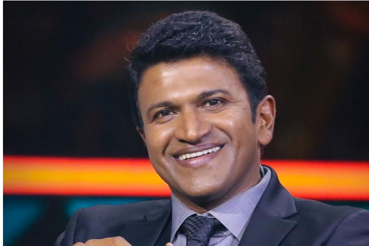
Late actor Puneeth Rajkumar.

Puneeth Rajkumar (46), Kannada actor and philanthropist, passed away on Friday October 29, 2021 after suffering a cardiac arrest. The incident took place early in the morning when he complained of chest pain during his routine workout. He was rushed to Vikram Hospital in Bengaluru and was immediately shifted to the ICU at 11:30 in the morning after being inspected by a group of doctors who stated that he was unresponsive and was in Cardiac Asystole. "At the time of arrival to the emergency, Mr. Puneeth Rajkumar was non-responsive and was in cardiac asystole. Hence, immediate advanced cardiac life support measures were initiated for