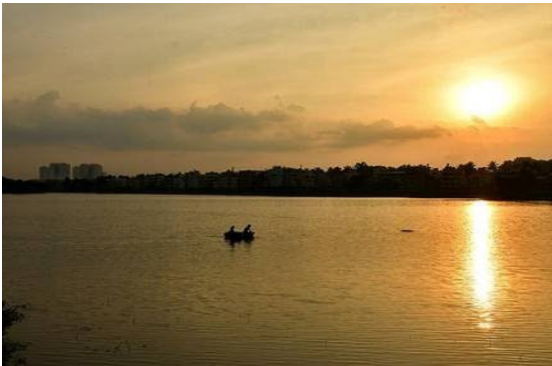
The rejuvenated Sarakki Lake in JP Nagar, Bengaluru.