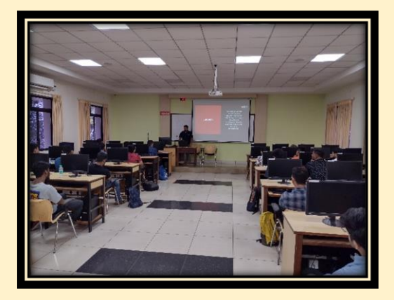
Address by student club representatives