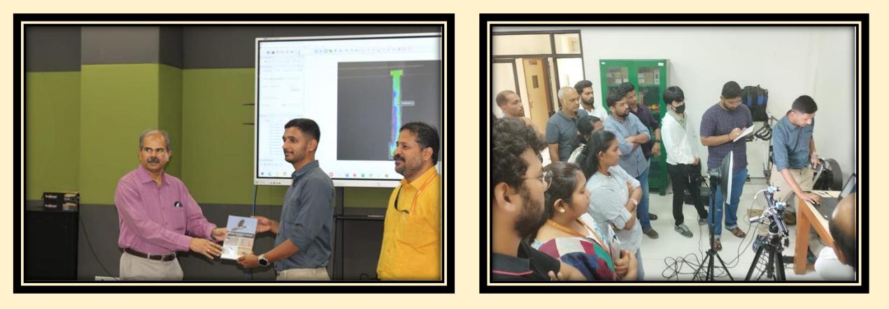
Workshop on Digital Image Correlation

Ocular Tribology Group, MAHE under the initiative of Dept. of Mechanical & Industrial Engg. has organized a one-day Hands-On workshop on "Digital Image Correlation" on 15th March 2023, followed by two days of training for faculty and research scholars of MAHE and nearby institutions. The workshop was conducted by experts from Pyro Dynamics Bangalore, an authorized dealer of Correlated Solutions Inc., USA. Tribology is the study of friction, wear, and lubrication of interacting surfaces in relative motion. The principles of Tribology and design benefits are making a major impact in a variety of modern applications such as biomedical, nanotechnology and alternative energies. The application of Tribology in biological systems is a rapidly growing field and extends well beyond the conventional boundaries.