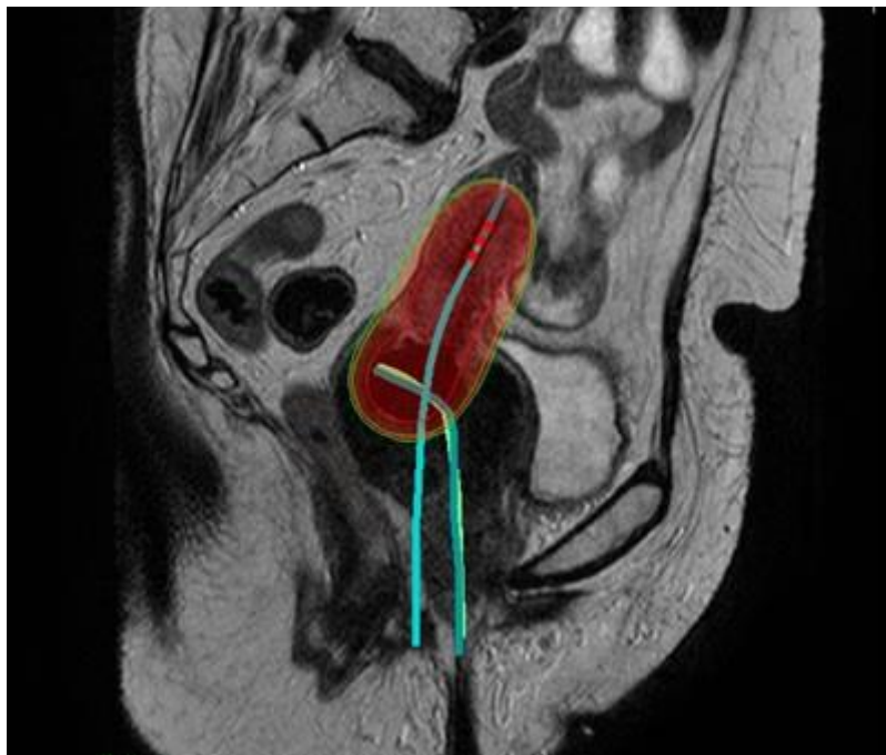
Radiotherapy- brachytherapy 4