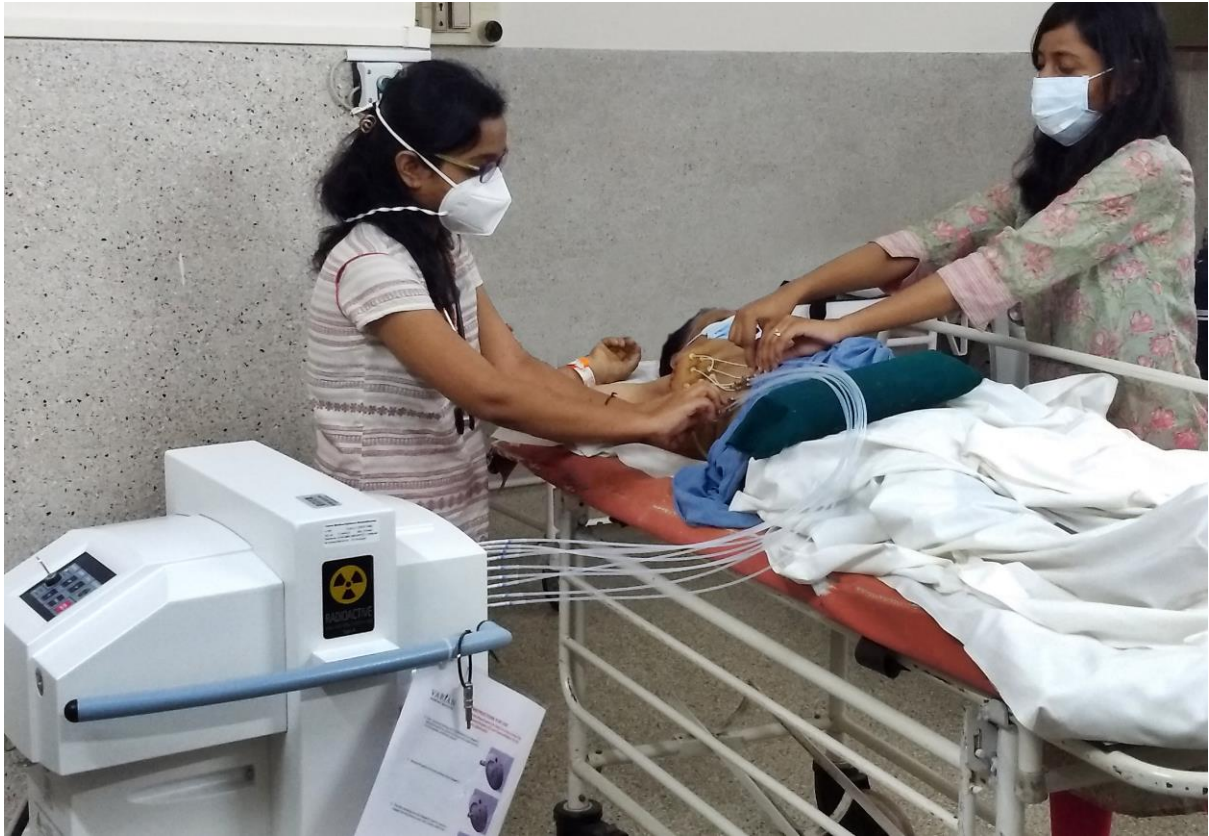
Radiotherapy- Gammamed HDR brachytherapy 2 (2)