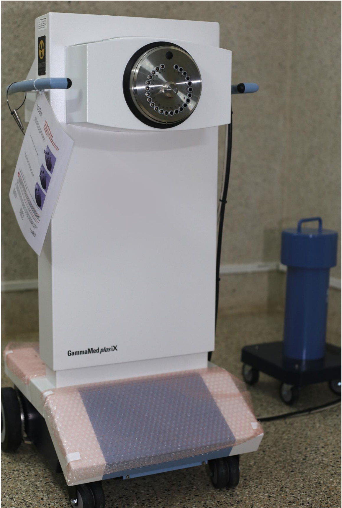
Radiotherapy- Gammamed HDR brachytherapy_radiotherapy