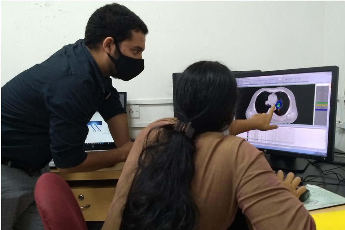
Radiotherapy- TPS 1