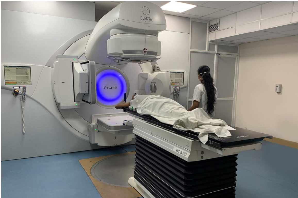
Radiotherapy- Versa HD Linac 2