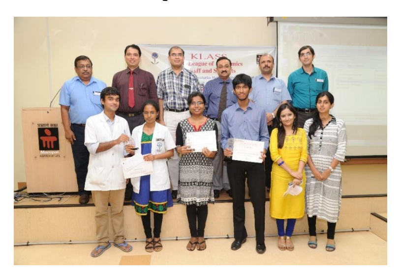
Neurosciences Quiz - 2017