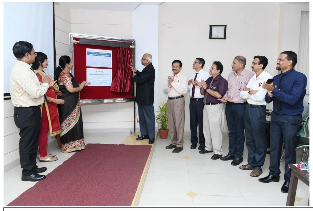
Plaque unveiling ceremony of Manipal posion information centre (2019)