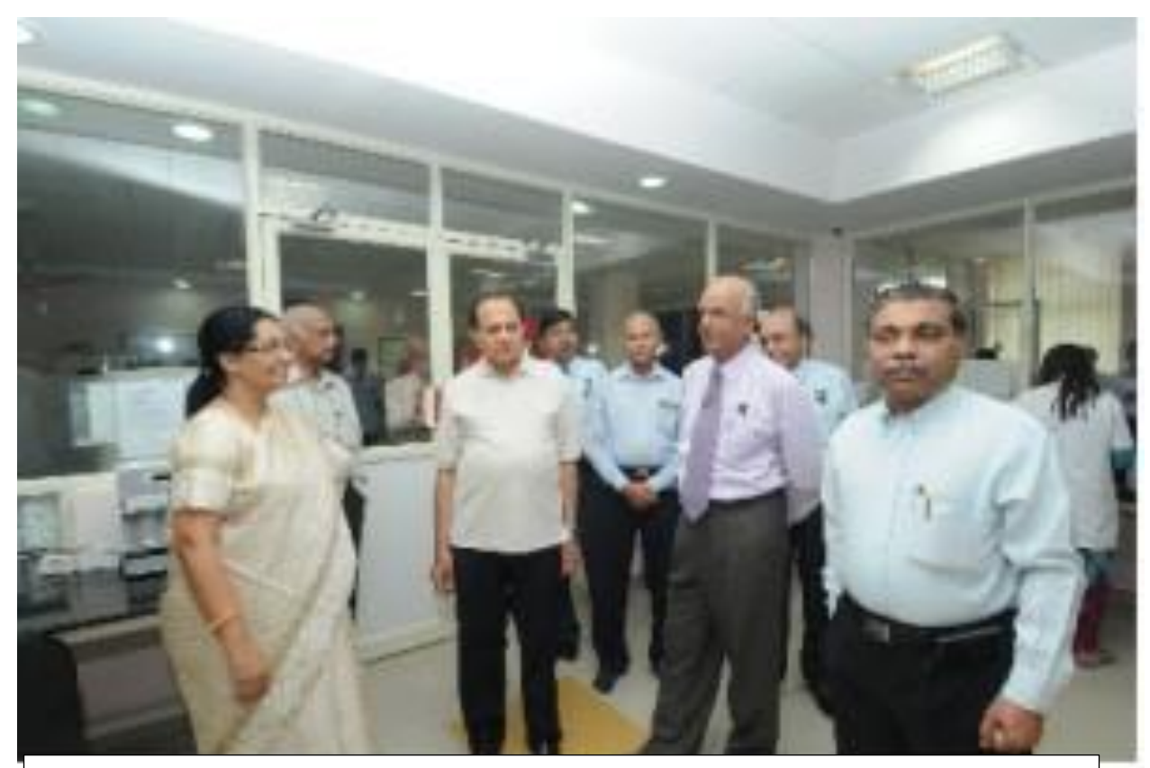
Center of excellence for Inborn error of metabolism screening -